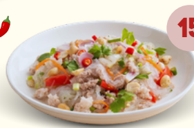
Yum Mama 🌶️ Spicy Mama noodle salad with shrimps in lime-chili dressing