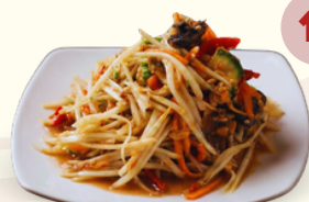
Tam Thai Classic papaya salad carrot, peanut, tomato, green long beans